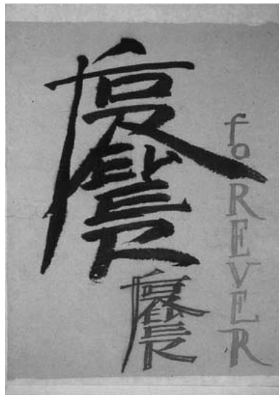
The English word forever, written as if it were Chinese calligraphy, by Xu Bing.

Of course, the Chinese are not the only people to supply a hybrid "lish" to English. Korea has gone even further than China in incorporating English into their vernacular. The linguistic situation in Korea is somewhat unusual. Due initially to geographic location, the language of South Korea has a very large number of loan words from other languages. In the past, these came primarily through and from China. With the rise of globalization, European lan-